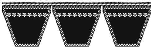
ENVELOPE CROSS SECTION

* Refer to Goodyear Matchmaker System (page 72)